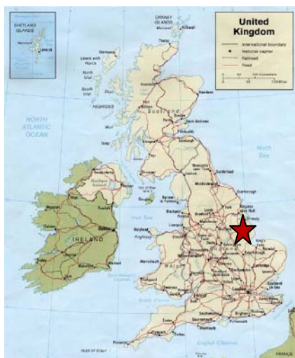
Map courtesy of mapcruzin.com

screening and treatment at more than 100 sites to 15-24 year olds living in Northern Lincolnshire. The program also provided an option to order a free do-it-yourself (DIY) testing kit online or by text. The COAST team sent results by text, email or mail as requested by the person being tested, and offered to notify sexual partners on behalf of those who tested positive.